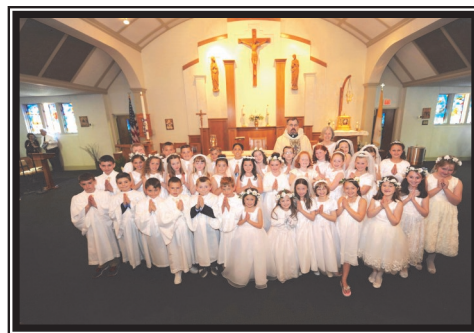
Our Faith Formation program is an important part of our growing parish!

The addition of Bible Study and Book Clubs for adults throughout the year has helped to remind us that we are life-long learners of faith!