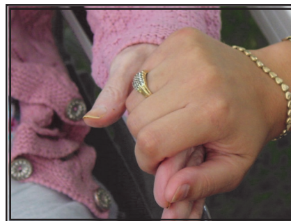
Our Eucharistic Ministers bring the gift of Holy Communion to those that are homebound, as well as residents of area nursing homes.

Our Prayer Shawl Ministry comes together weekly to lovingly knit shawls for those needing comfort. 65 have been given already, and 27 baby blankets have been knitted for baptism gifts.