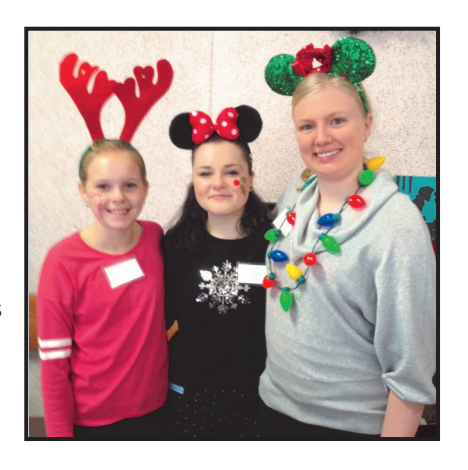
Our Faith Formation program is an important part of our growing parish!

The addition of Bible Study and Book Clubs for adults throughout the year has helped to remind us that we are life-long learners of faith!