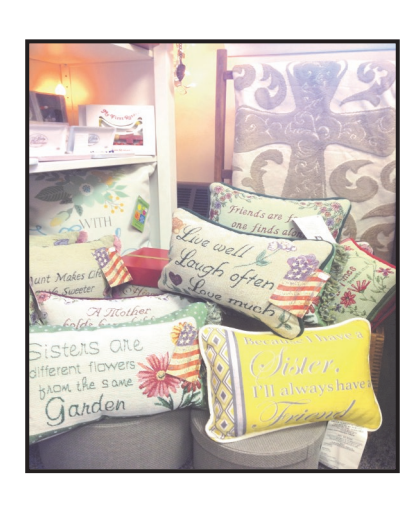
Our Welcome Center and Parish Store has 8 wonderful volunteers who ensure everyone feels at home here at St. Johns!

Our Prayer Shawl Ministry comes together weekly to lovingly knit shawls for those needing comfort, as well as baby blankets to be given as baptism gifts.